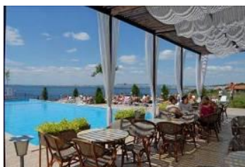
Dolce Vita 1